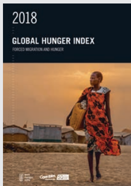
The cover of the 2018 GHI Report, "Forced migration and hunger".

We also provide our country teams with advice and support so the learning and impact of their programmes is better used to influence development or humanitarian policies and as importantly, practices.