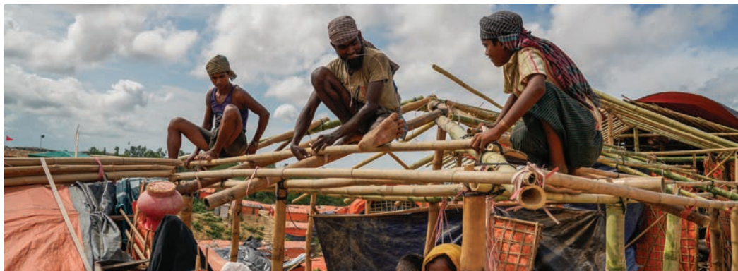
Rohingya men rebuilding their tents before the monsoon arrives, Jamtoli, Ukhiya.

The Alliance takes the issue of safeguarding to be of prime importance and is developing pooled resources to strengthen its policy and practice to prevent and effectively respond to all types of abuse.